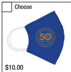
50th Anniversary Face Mask