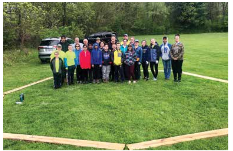
Members of the Junior Optimist Club of the Farmington STEAM Academy gather to build a gaga ball pit at Heritage Park in Farmington Hills, Michigan.