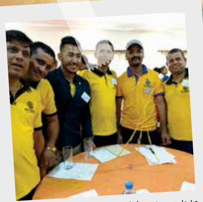
A group of conference participants work to produce a tower of spaghetti, tape and string that will support a marshmallow at the top.

There is no question Nepal will be the foundation for expansion of Optimist International in southeast Asia. The Optimists there have a great understanding of both the mission of Optimist International and the administrative side of operating a Club. This bodes well for the