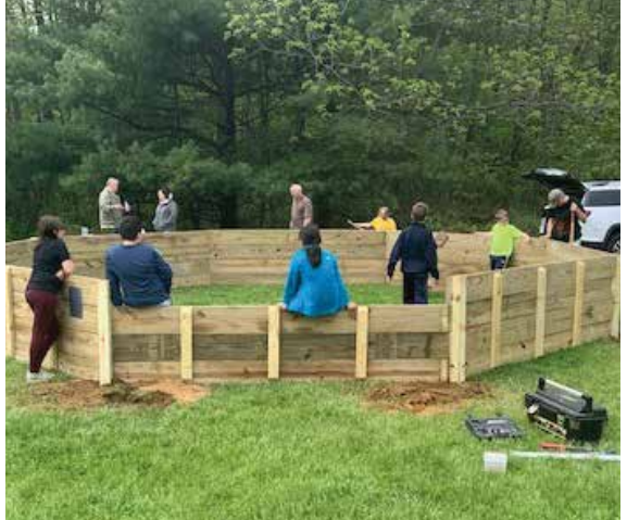
The gaga ball pit frame is almost completed.