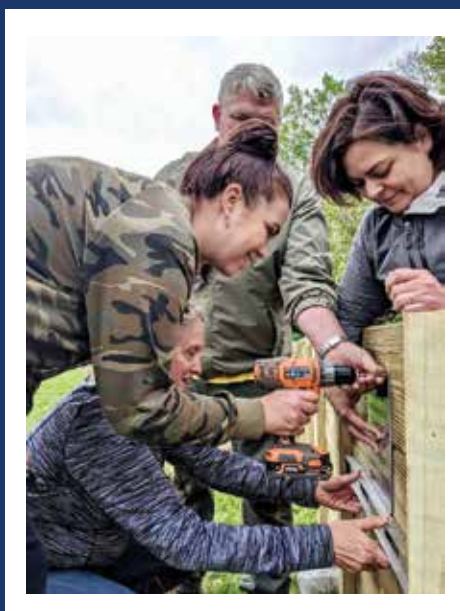
Volunteers work together to construct the gaga ball pit.