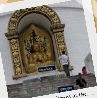
A sign asks for silence at the Peace Pagoda in Pokhara, Nepal

This was not an allwork-and-no-play stay in Nepal. There was a trip to a small waterfall in the middle of Pokhara, a stop at one of the deepest caves in Asia and a visit to a Japanese Peace Pagoda perched atop a mountain