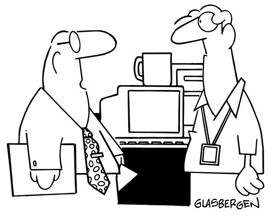
"We can't replace your old computer. That would be age discrimination"