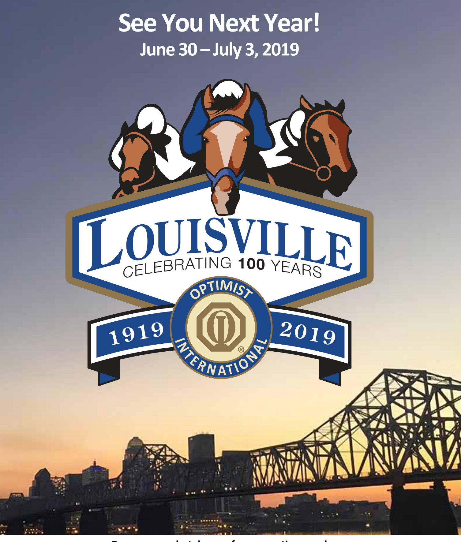
Reserve your hotel room for convention now!

To book your reservation, go to the housing section of the convention page of the website at <a href="https://www.optimist.org/convention">www.optimist.org/convention</a>