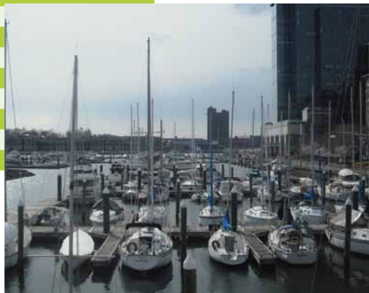
Just by taking a water taxi, you can see all of the sights in this newsletter and much, much more!