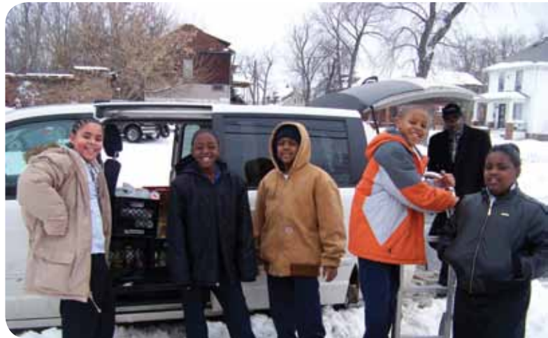
JOOI gets in the game! Members get ready to hand off tons of canned goods to a local food pantry.

During this year's Souper Bowl of Caring, JOOI Members at Loving Elementary School in Detroit, Michigan, went far beyond the typical game plan to help those in need during the weeks leading up to the Super Bowl.