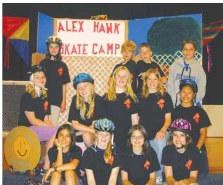
Members of the En-JOOI-ing Performance! Club help classmates by putting on plays about all kinds of topics. Most recently they put on a show about skateboard safety that followed a story similar to A Christmas Carol.