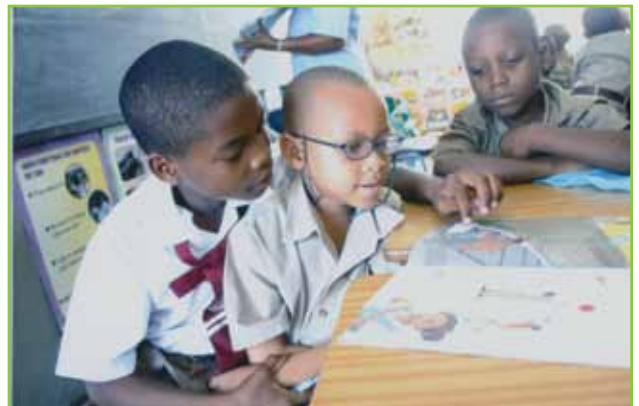
Students in the Independence City Primary Junior Optimist Club decide to celebrate the JOOI of Reading by teaching their classmates how to be "enlightened" through great books and by participating in "Read Across Jamaica Day."

JOOI Clubs can also look to other Clubs for inspiration. The Independence City Primary Junior Optimist Club in Jamaica has made JOOI of Reading their main focus. During "Read Across Jamaica Day," schools all over Jamaica celebrate a day for island-wide reading. The JOOI Club decided this day would be the perfect time to sponsor a reading workshop. They also organized a Literacy Fair last year when they read with students at different reading levels each day, working under a theme of "Read to Be Enlightened."