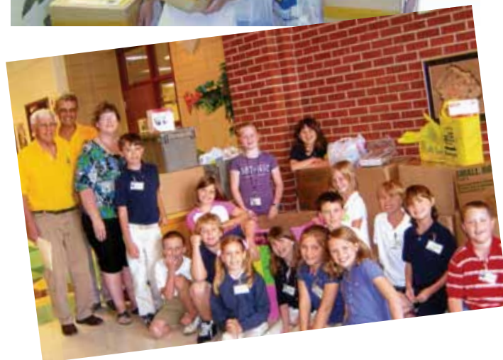
The Elberta JOOI Club had perfect attendance on the day the young JOOI Members went out to collect medical supplies from area businesses. They collected a bunch of supplies, boxed them up and sent them to Tanzania missionaries for delivery!