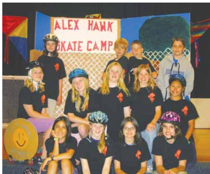
Members of the En-JOOI-ing Performance! Club help classmates by putting on plays about all kinds of topics. Most recently they put on a show about skateboard safety that followed a story similar to A Christmas Carol.