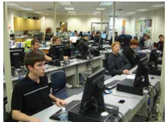
Students at Robinson High School in Virginia help kick off the new Digital Media Literacy Tour.