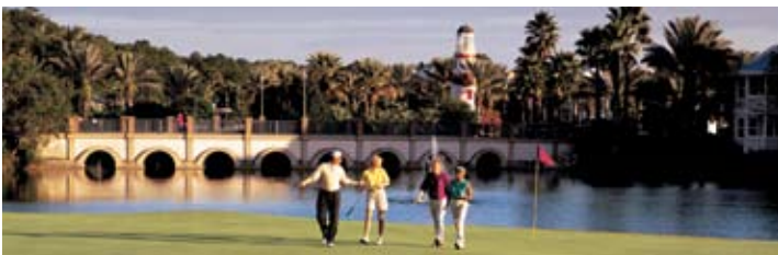
Optimist Junior Golf introduces the new Parent-Child Classic at Disney's Lake Buena Vista Golf Course.

(Orlando area) for the fifth annual event. The tournament is also moving up in the schedule to November 7-8. Top junior golfers ages 14-18 will compete on Orange County National's Crooked Cat course.