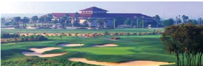
The Tournament of Champions moves to Orange County National Golf Center & Lodge for 2009.

District qualifying events will take place in the coming months in preparation for the international championships at PGA National Resort and Spa in Palm Beach Gardens, Florida. Approximately 650 junior golfers are expected to make their way to the tournament this summer. Boys and girls ages 10-15 will compete July 23 through 28, and boys and girls ages 16-18 will compete July 28 through August 2.