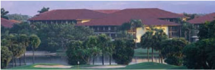
The Optimist International Junior Golf Championships return to PGA National Resort and Spa for the 15th annual event.

The new year has brought about new developments in the Optimist Junior Golf Program. With a new location for the Tournament of Champions and a new parent/child event, the possibilities are exciting for those Optimists who volunteer with junior golf.